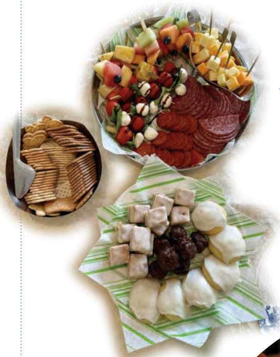
Residents and loved ones gathered around the table to socialize over a light lunch and delectable desserts.